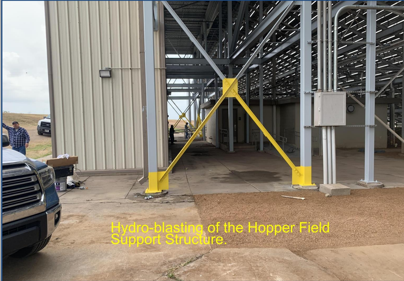
Hydro-blasting of the Hopper Field Support Structure.